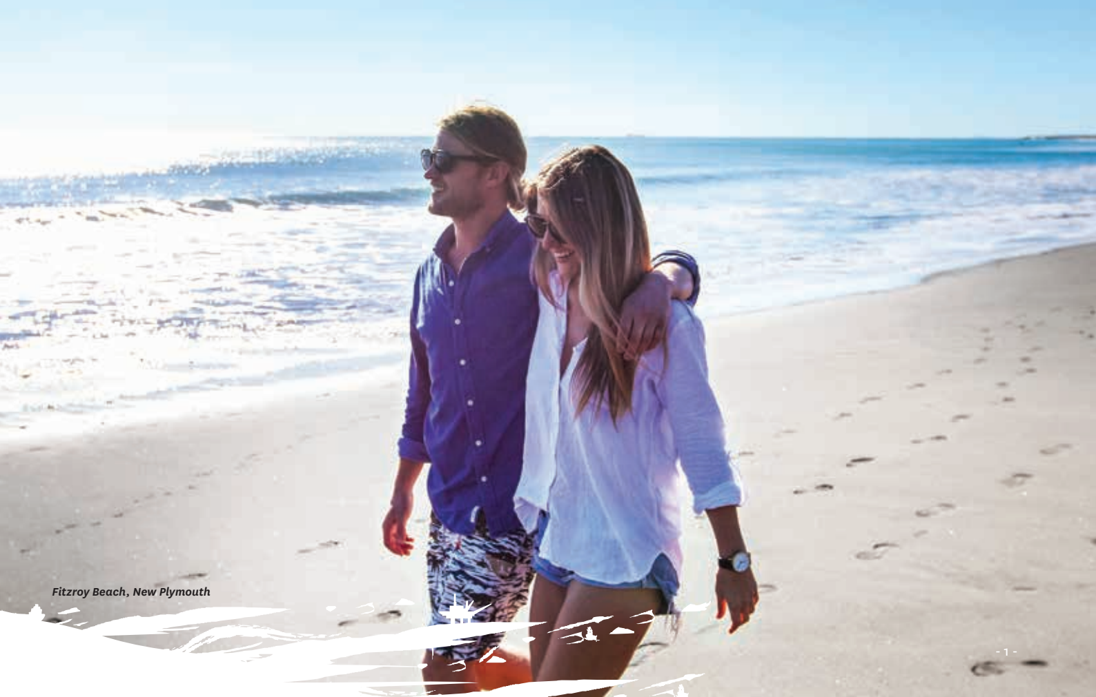
Fitzroy Beach, New Plymouth