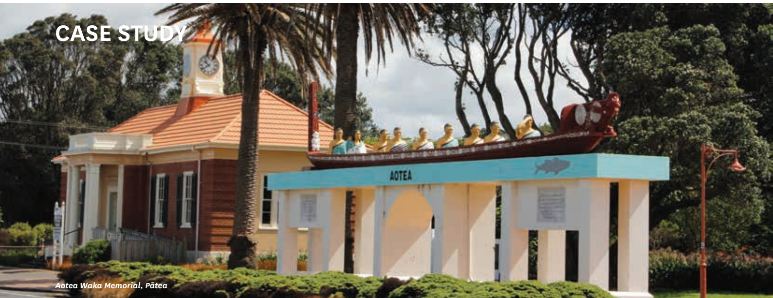
Aotea Waka Memorial, Pātea