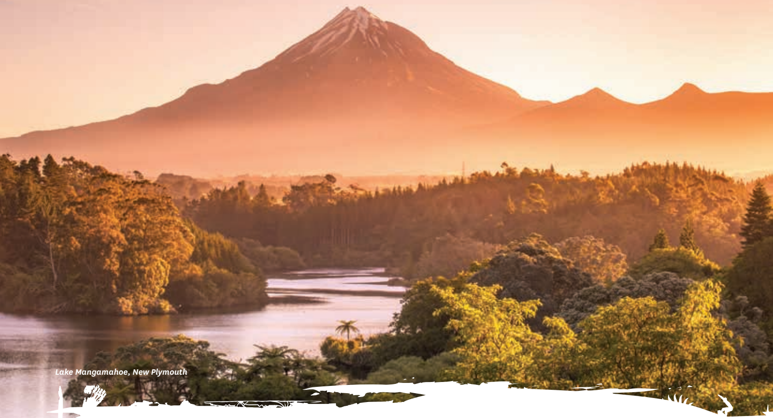
Lake Mangamahoe, New Plymouth