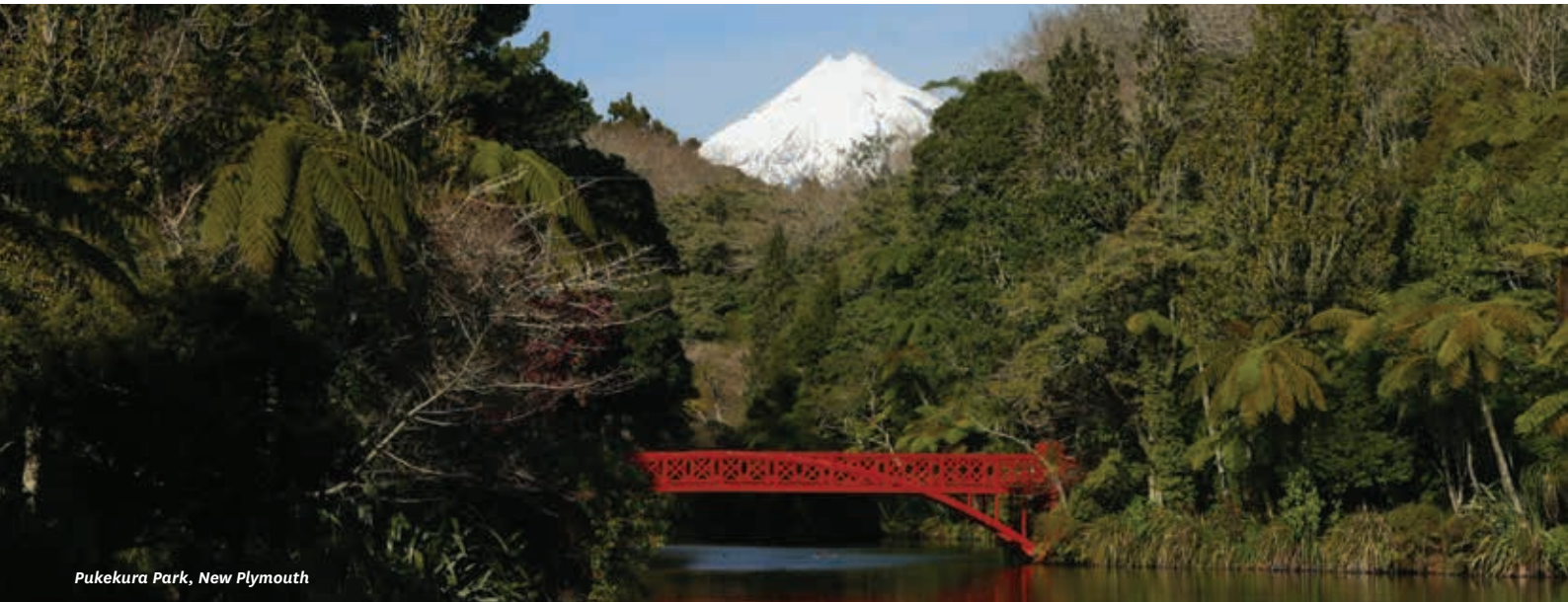
Pukekura Park, New Plymouth