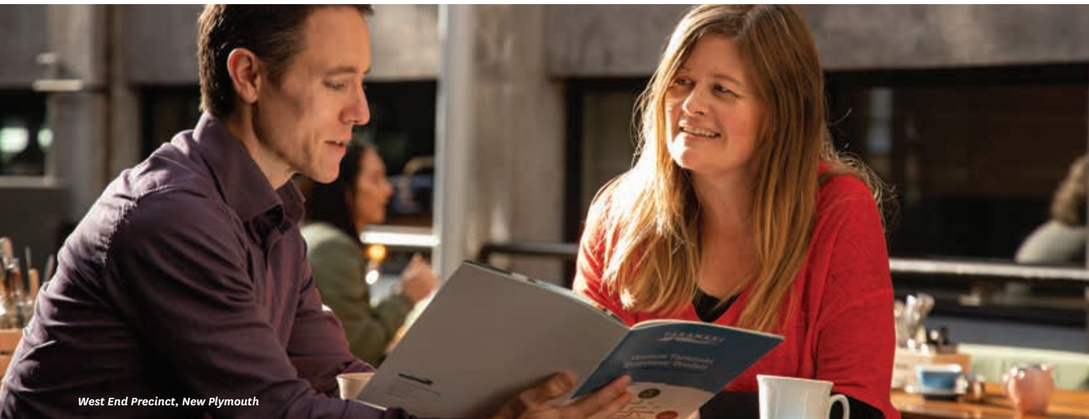
West End Precinct, New Plymouth