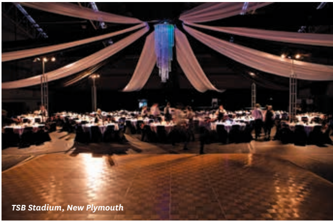
TSB Stadium, New Plymouth