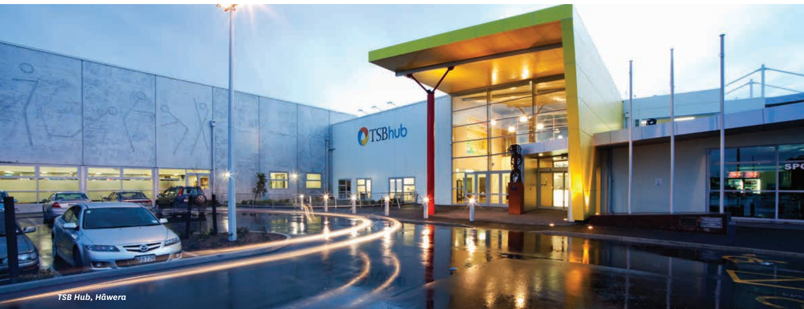
TSB Hub, Hāwera