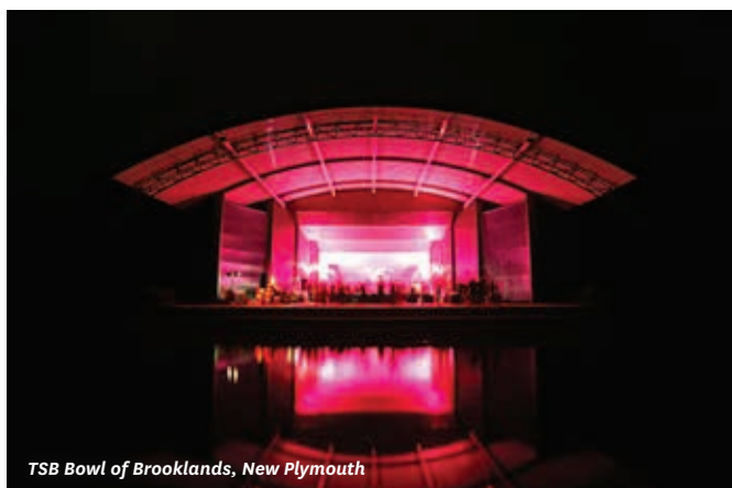
TSB Bowl of Brooklands, New Plymouth

"The quality of services available in the region coupled with the willingness of local businesses and the likes of Venture Taranaki to go the extra mile to promote events really sets us apart."