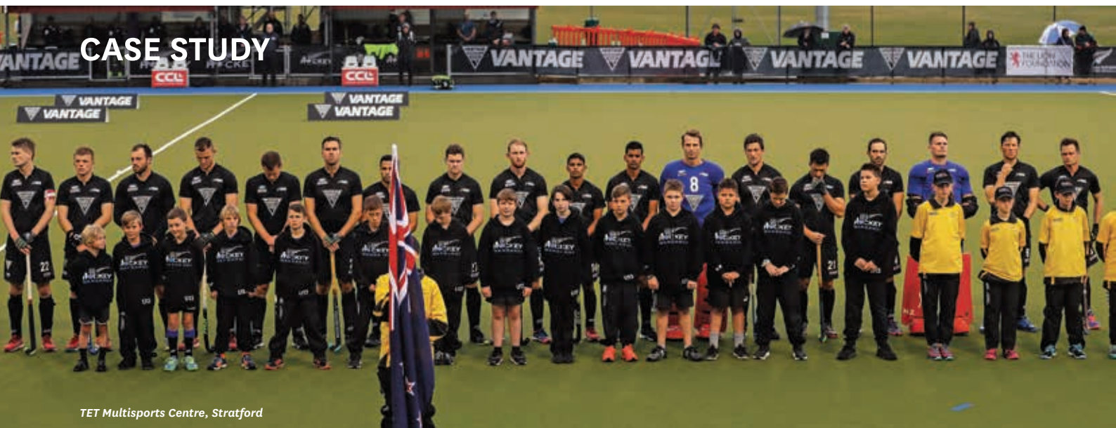
TET Multisports Centre, Stratford