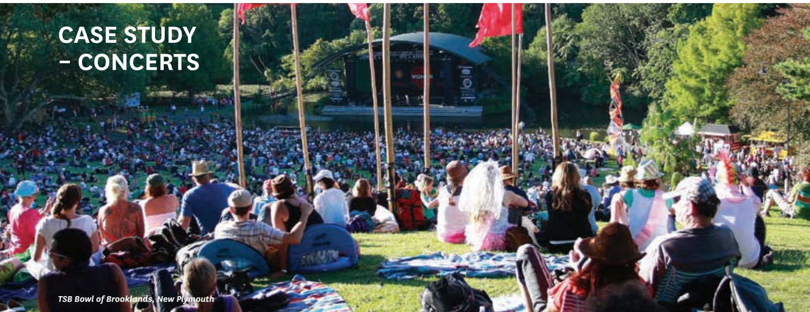
TSB Bowl of Brooklands, New Plymouth