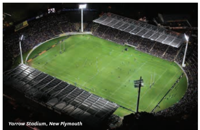
Yarrow Stadium, New Plymouth