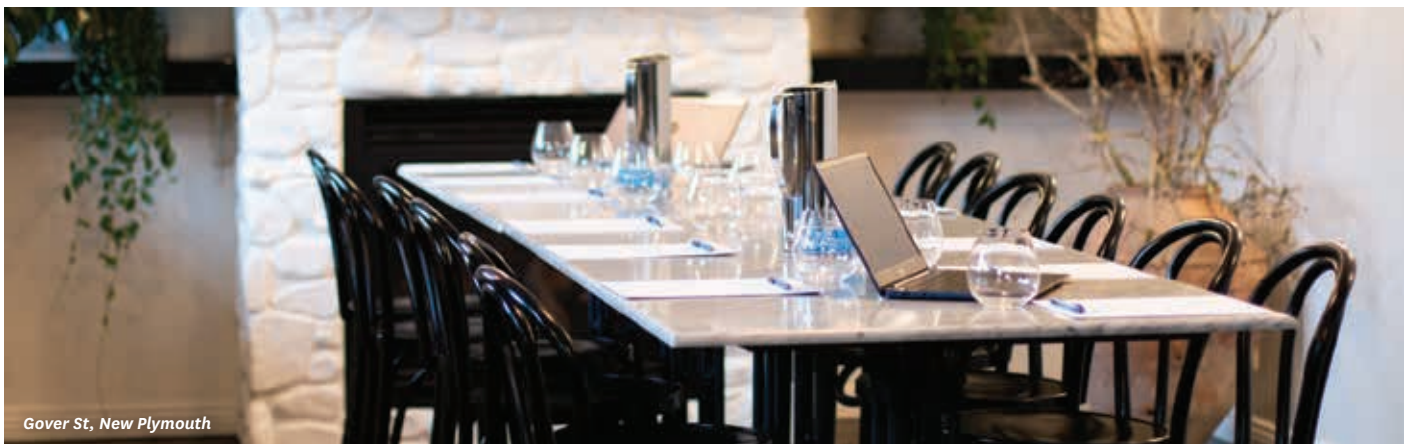
Gover St, New Plymouth