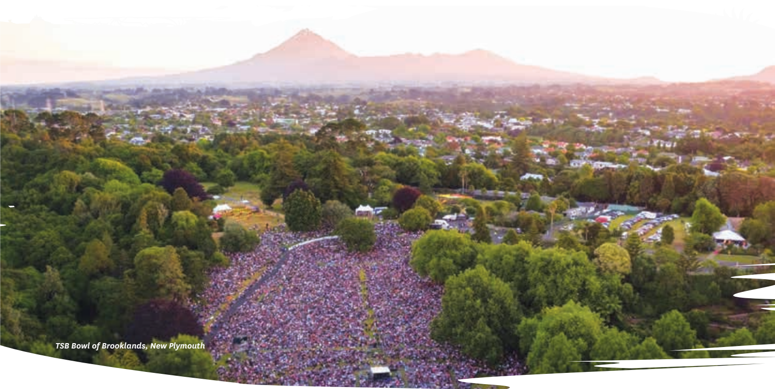
TSB Bowl of Brooklands, New Plymouth

THINKING ABOUT ORGANISING AN EVENT IN TARANAKI? HERE'S HOW TO MAKE IT A SUCCESS