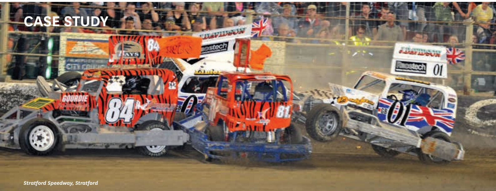
Stratford Speedway, Stratford