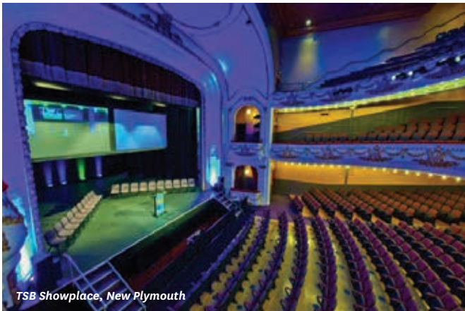
TSB Showplace, New Plymouth